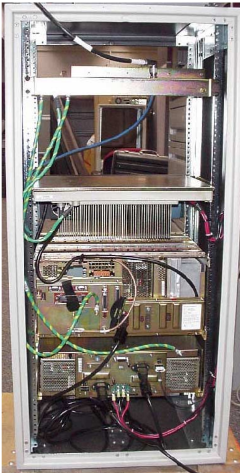
Rear View of Booster Amp Racked with Associated Base Station