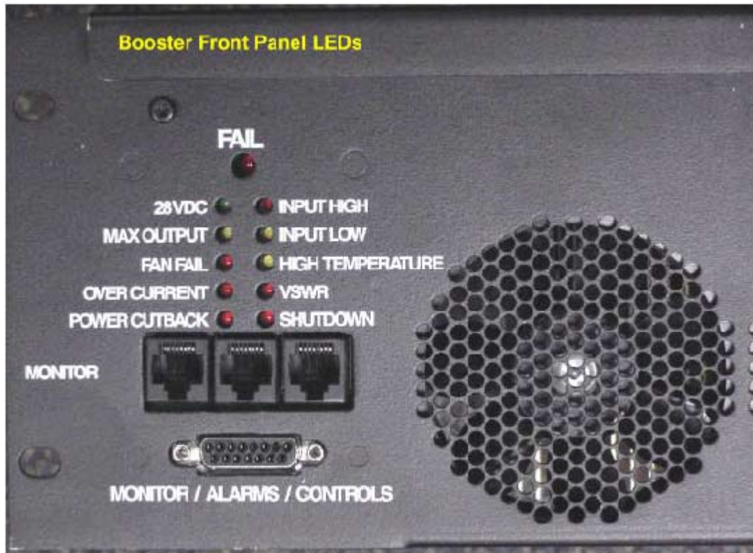
High Power Booster Front Panel LEDs