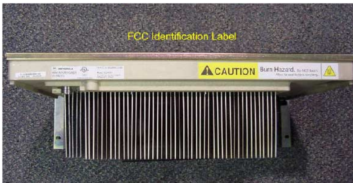
Rear of Booster Amp Including Location of the FCC ID Label