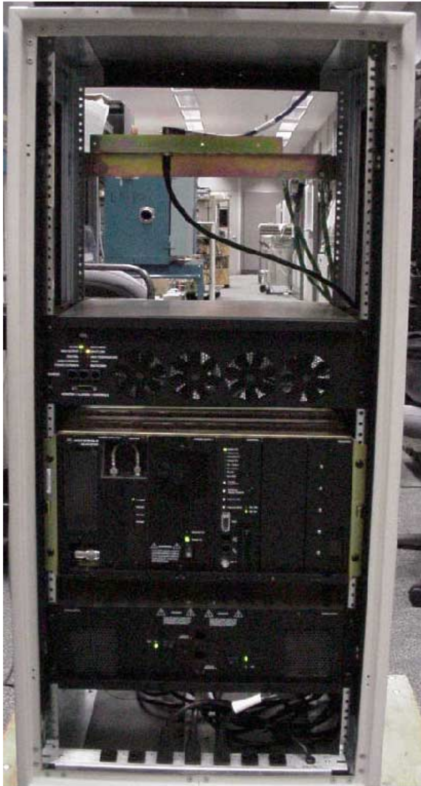
Front View of Booster Amp Racked with Associated Base Station