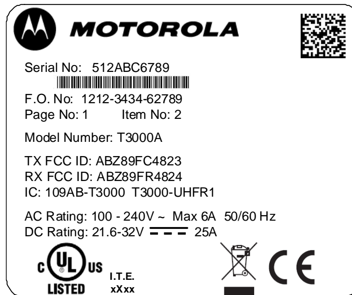
FCC Identification Label

Much of the information that is on the label, such as serial number, model number, etc. is driven by the ordering process and is unique per customer order.