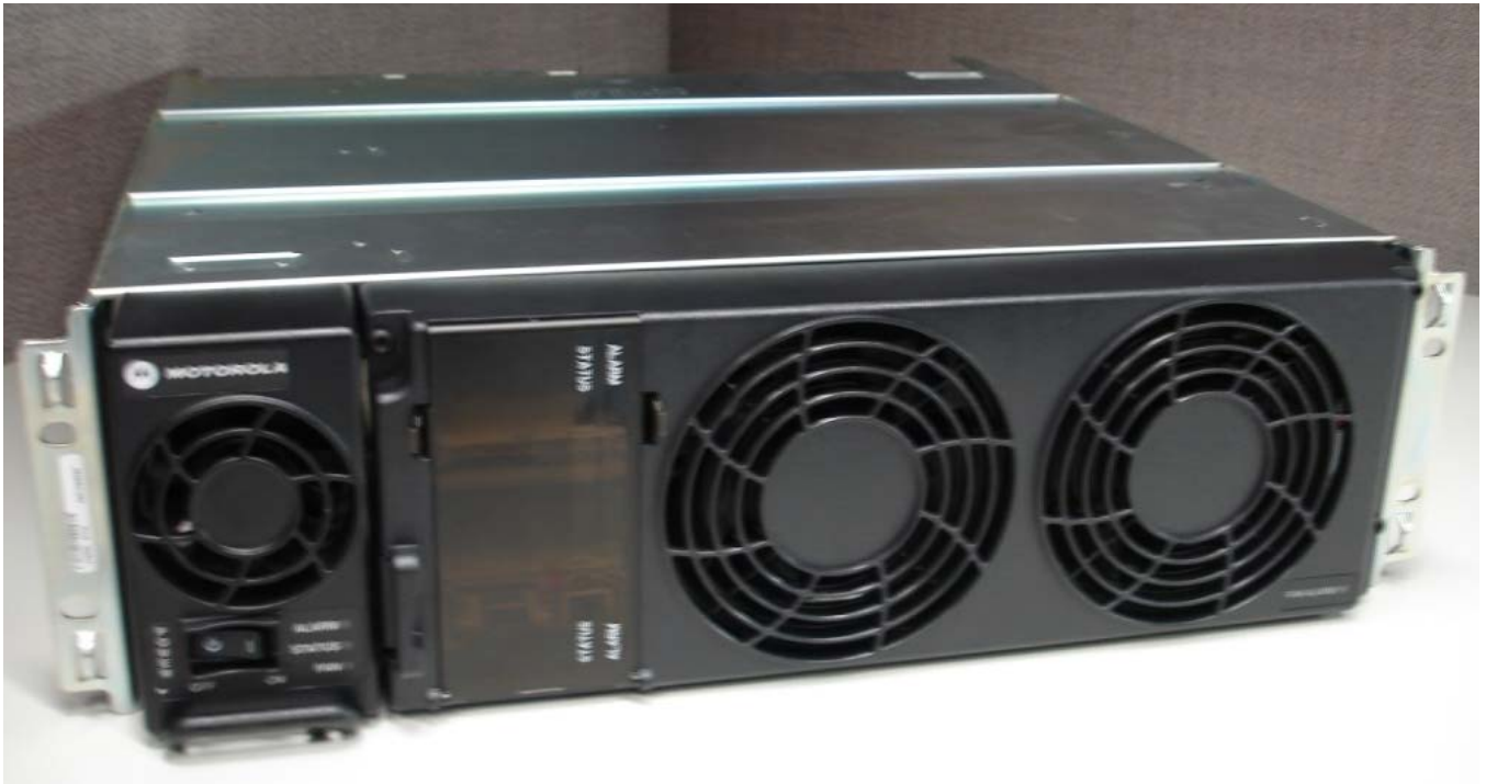
External Front View of Base Radio

EQUIPMENT TYPE: ABZ89FC4821B 109AB-4821B