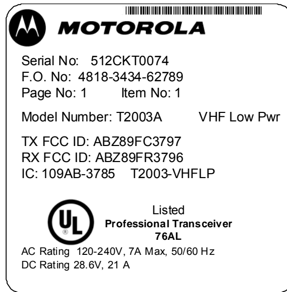
FCC / IC Identification Label

Much of the information that is on the label, such as serial number, model number, etc. is driven by the ordering process and is unique per customer order.