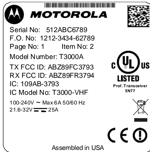
FCC / IC Identification Label

Much of the information that is on the label, such as serial number, model number, etc. is driven by the ordering process and is unique per customer order.