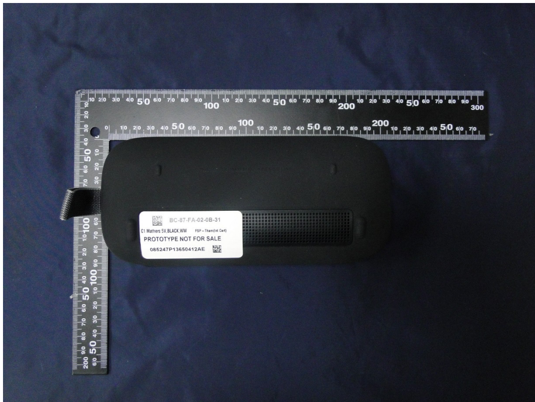
EUT rear view