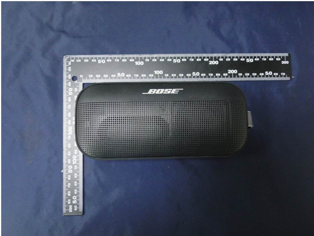
EUT front view