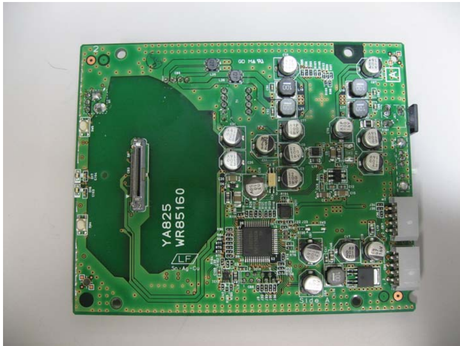
PWB Side B