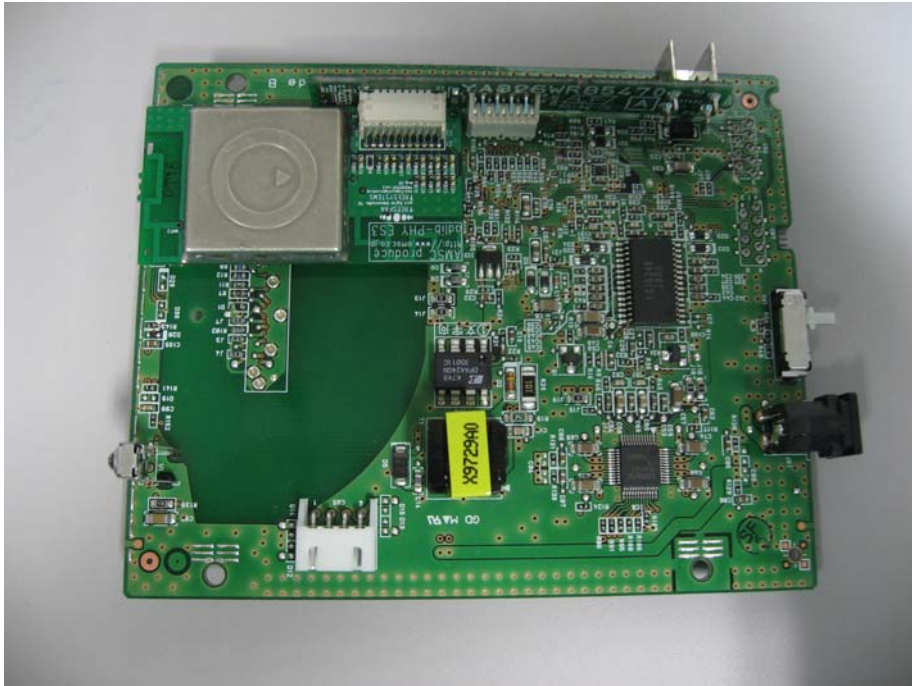
PWB Side A with Shield