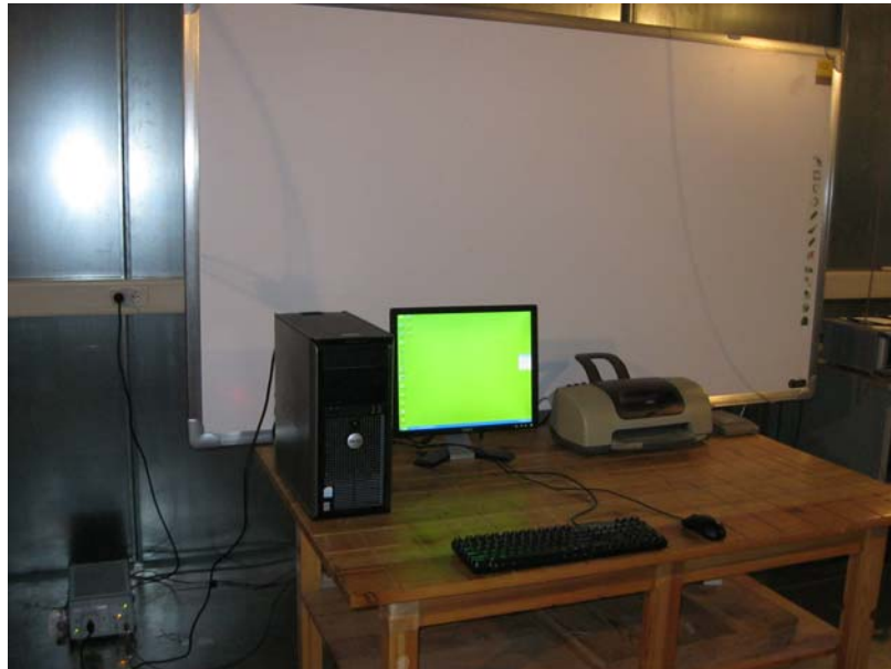
Figure 1 Conducted Emission Test Setup