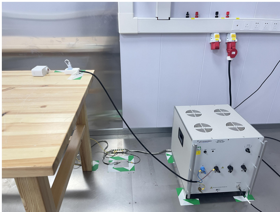
Radiated Measurement Photo (below 1 GHz)