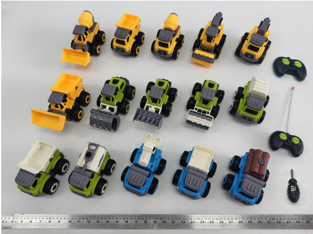
ALL VIEW OF EUT-1