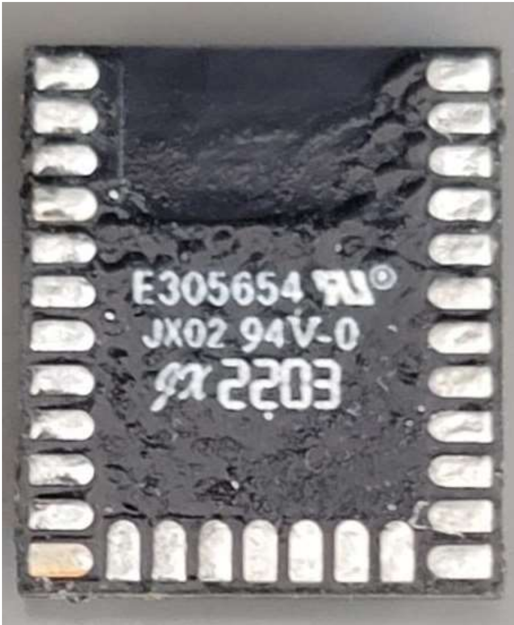
Bottom (solder side) of the BLE module removed from the circuit board.