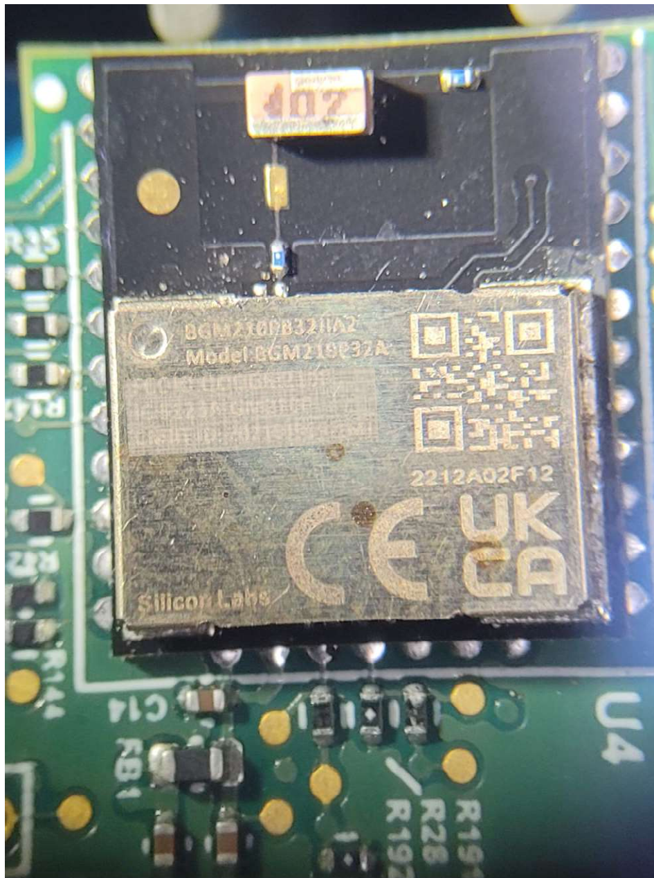
Closeup of the BLE module (BGM210PB32JIA2) installed on the circuit board.