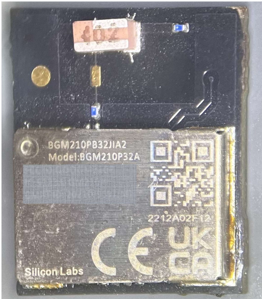
Closeup of the BLE module removed from the circuit board.