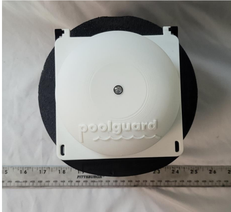
Figure 1. EUT, Top