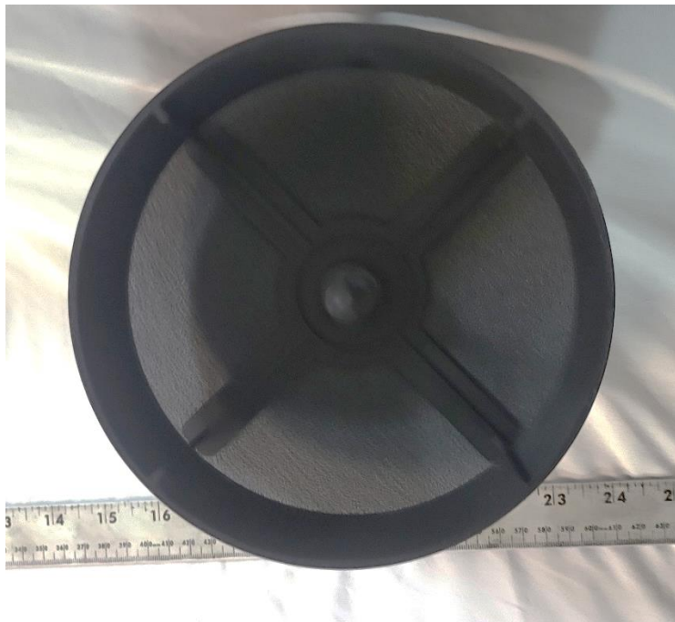
Figure 2. EUT, Bottom

FCC Part 15.231 Certification 2BPQ2-PGRMSB2 25-0109 June 9, 2025 PBM Industries, Inc PGRM-SB2