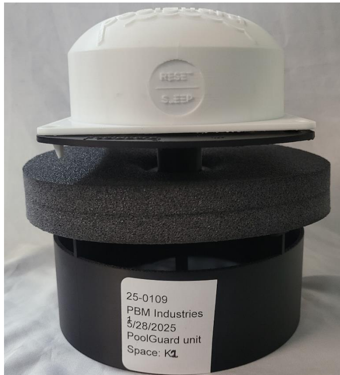
Figure 3. EUT, Front