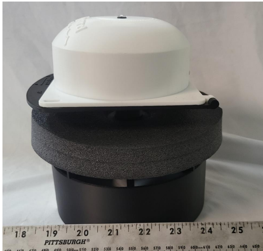
Figure 6. EUT Left, Side

FCC Part 15.231 Certification 2BPQ2-PGRMSB2 25-0109 June 9, 2025 PBM Industries, Inc PGRM-SB2