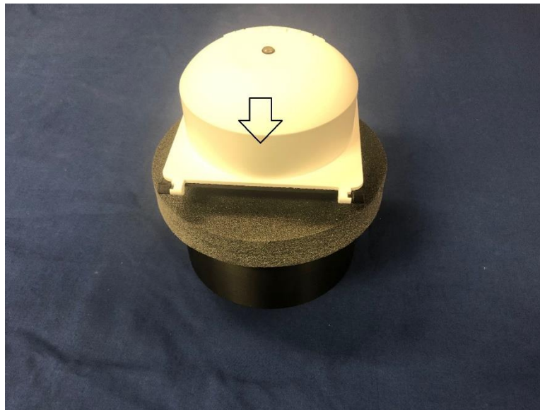
Figure 2. Label Location