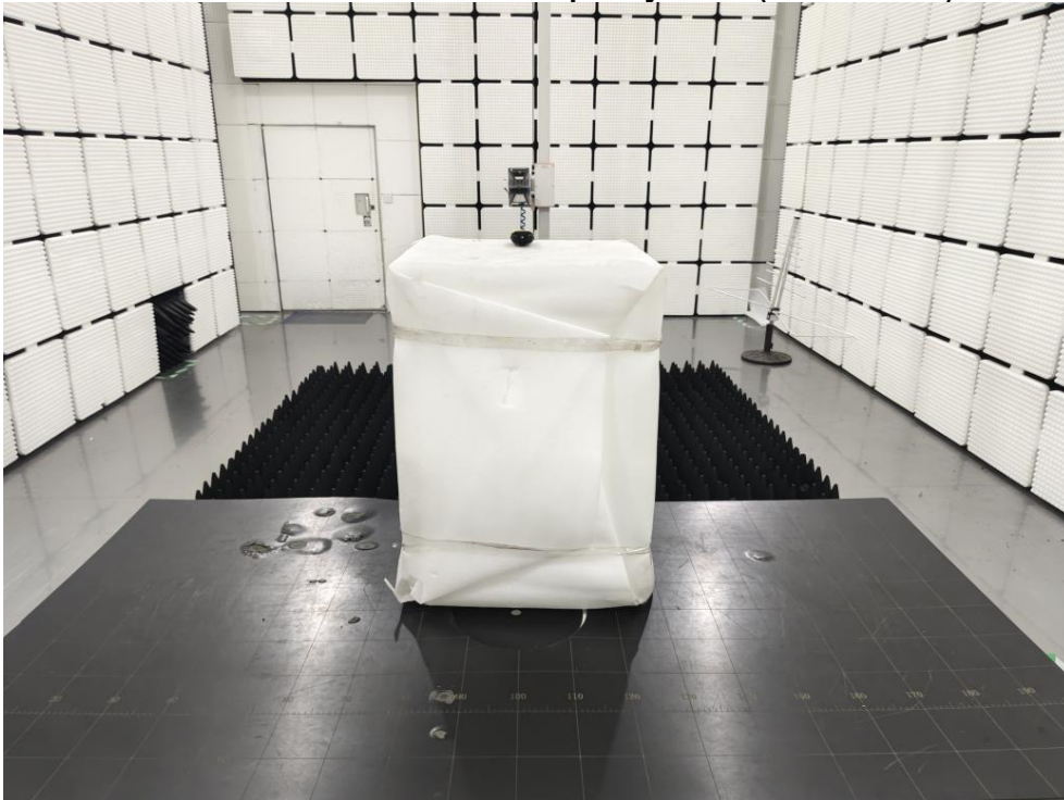
Emissions in Non-restricted Frequency Bands(Above 1 GHz)