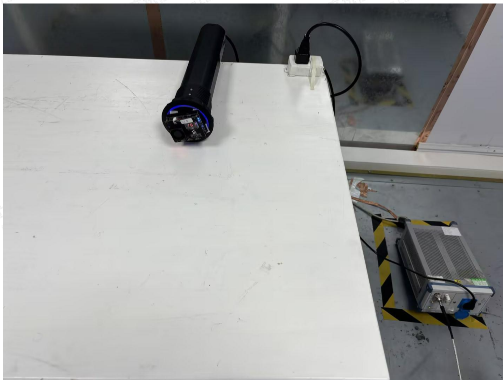
Conducted Emission-AC adapter charge mode