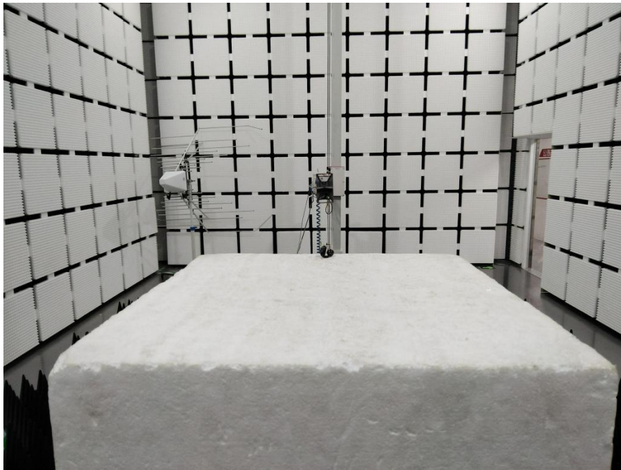
Radiated Spurious Emission (below 1GHz)