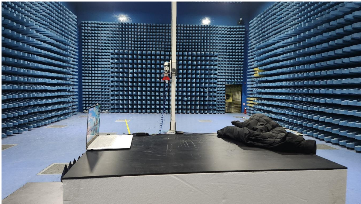
Radiated Spurious Emissions(18 GHz to 26.5 GHz)