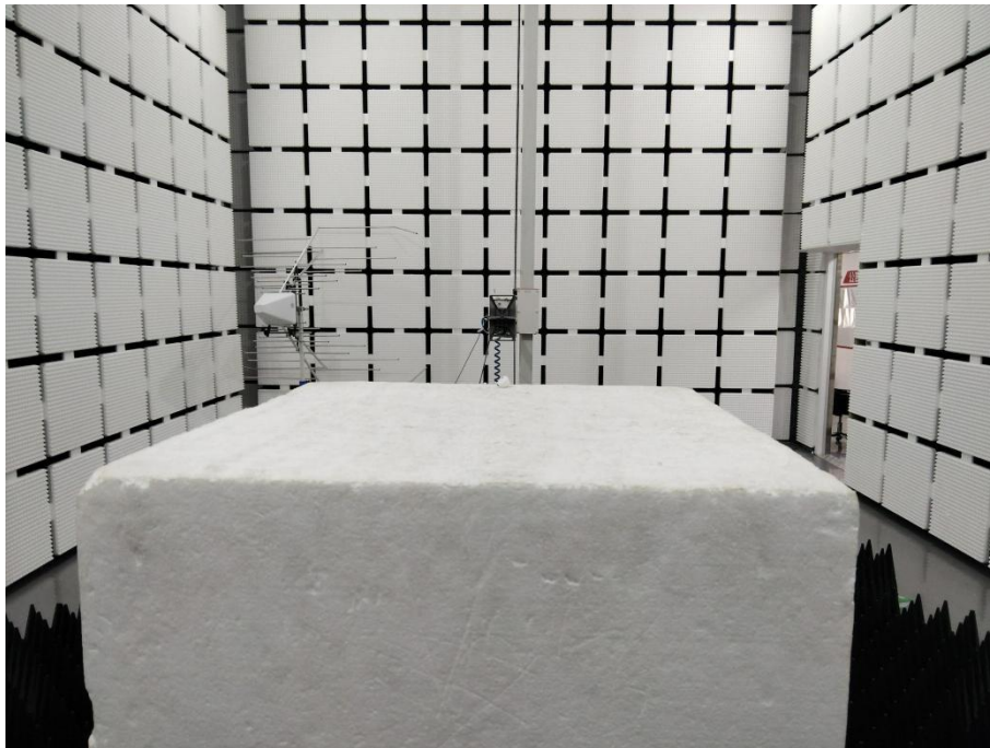
Radiated Spurious Emission (below 1GHz)