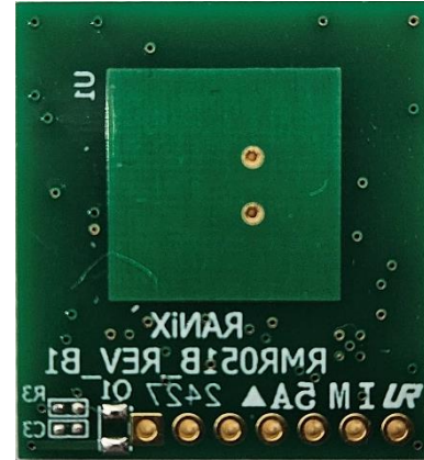
Figure 1. Antenna position