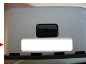
Attach to the bottom of the product