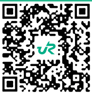
Scanning QR code UREVO APP