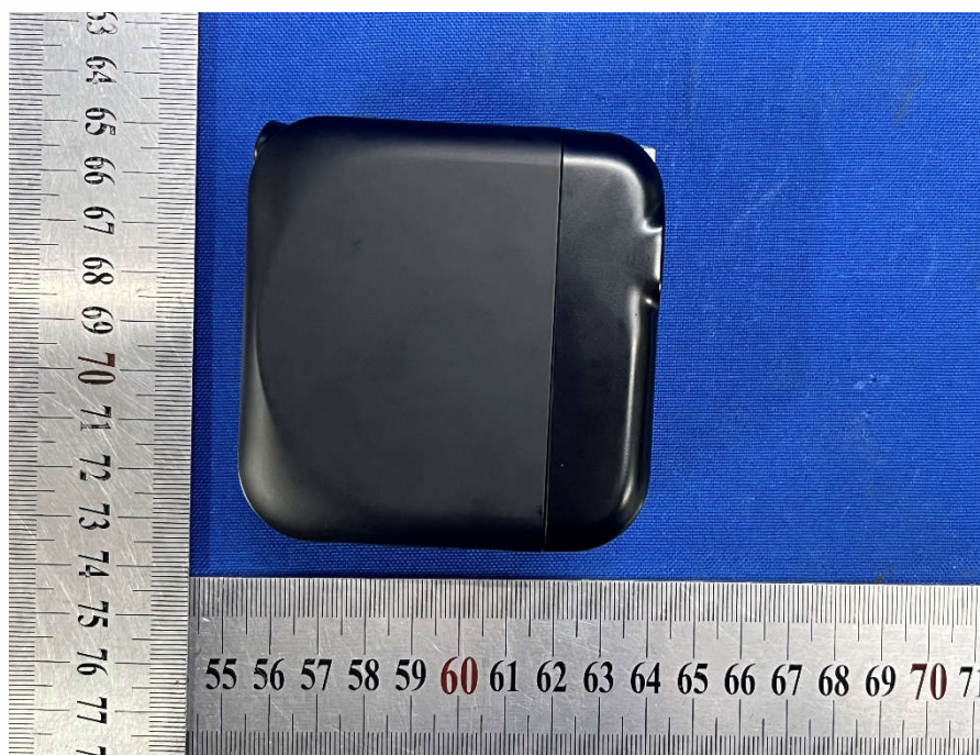
View of Product-02