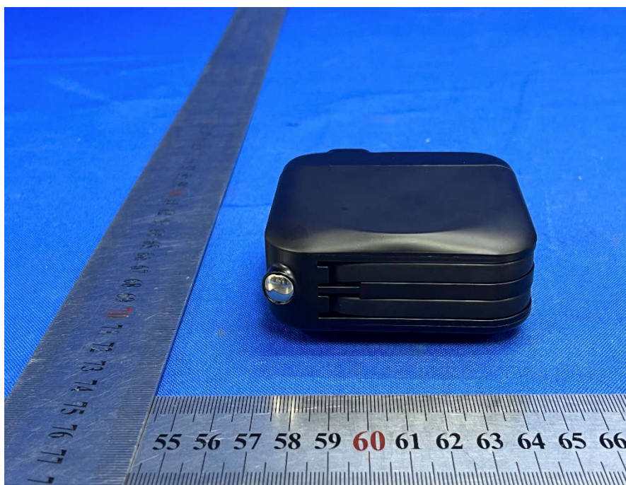
View of Product-06