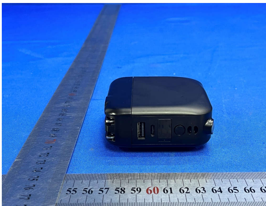
View of Product-04