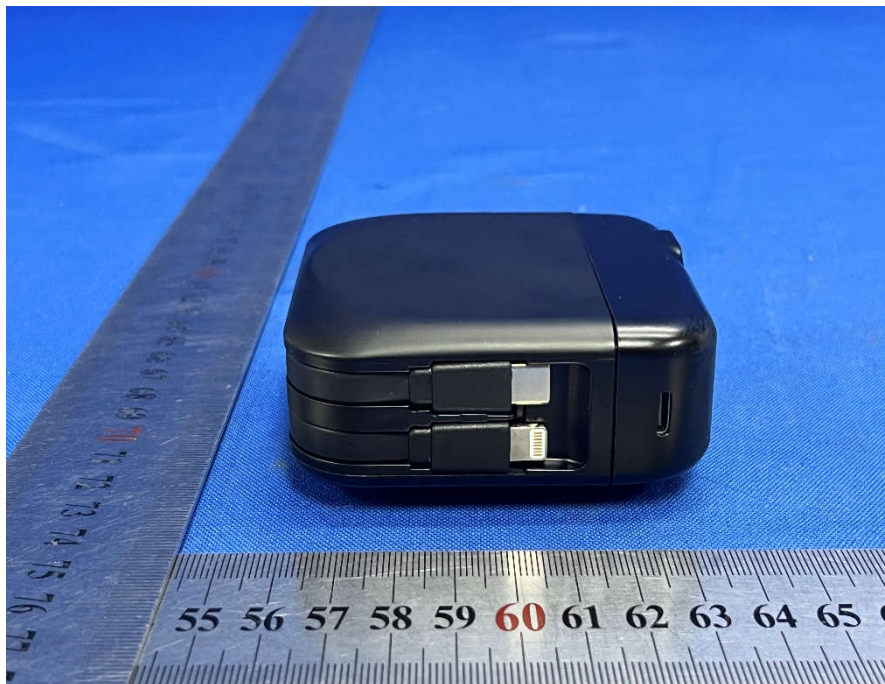
View of Product-03