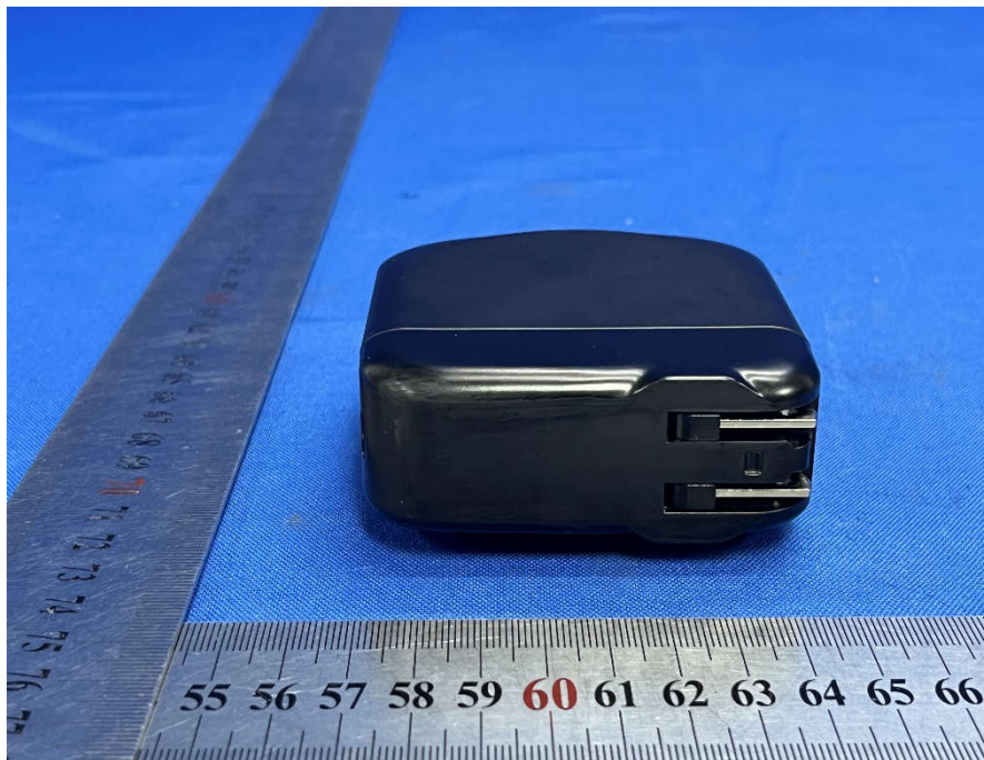
View of Product-05