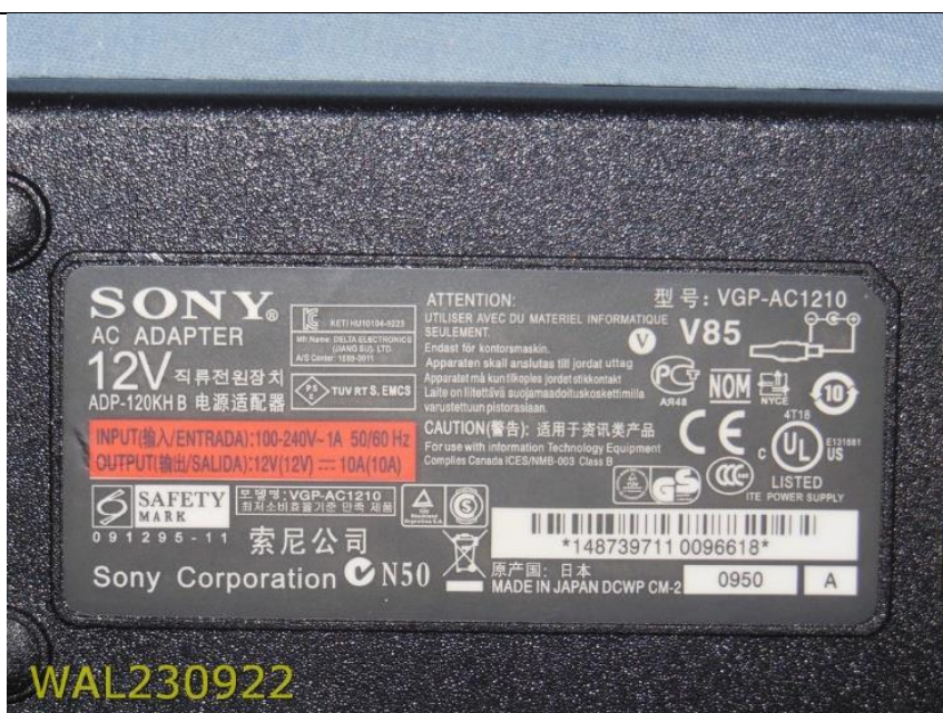
EUT Power Supply