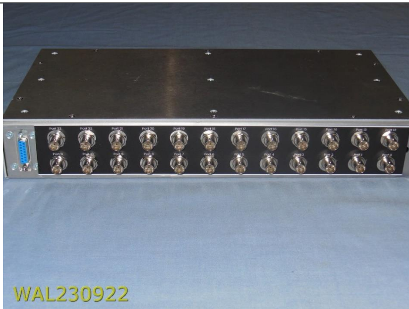
EUT View 1

This document shall not be reproduced in any form except in full.