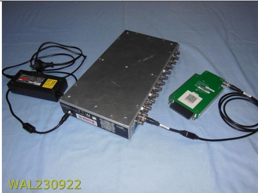
EUT, PSU, Antenna and Coax