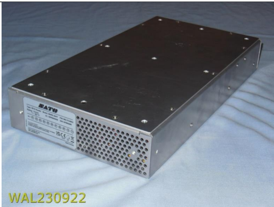
EUT View 4