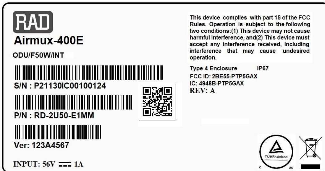
Airmux-400E ODU/F50W/INT label Artwork