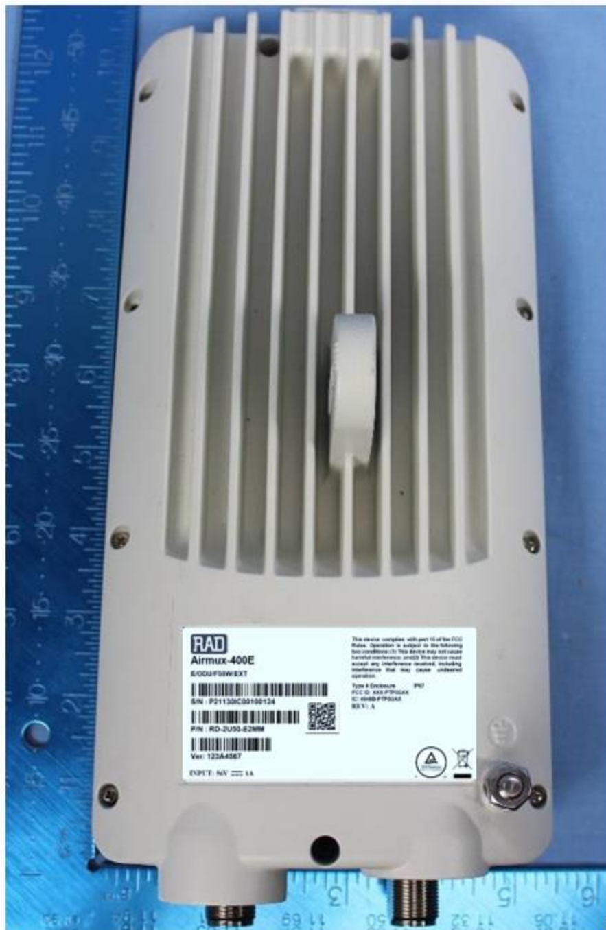
Airmux-400E ODU/F50W/EXT label Location