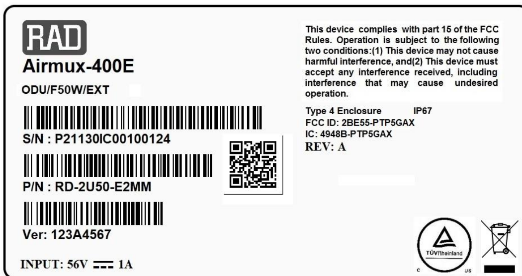
Airmux-400E ODU/F50W/EXT label Artwork