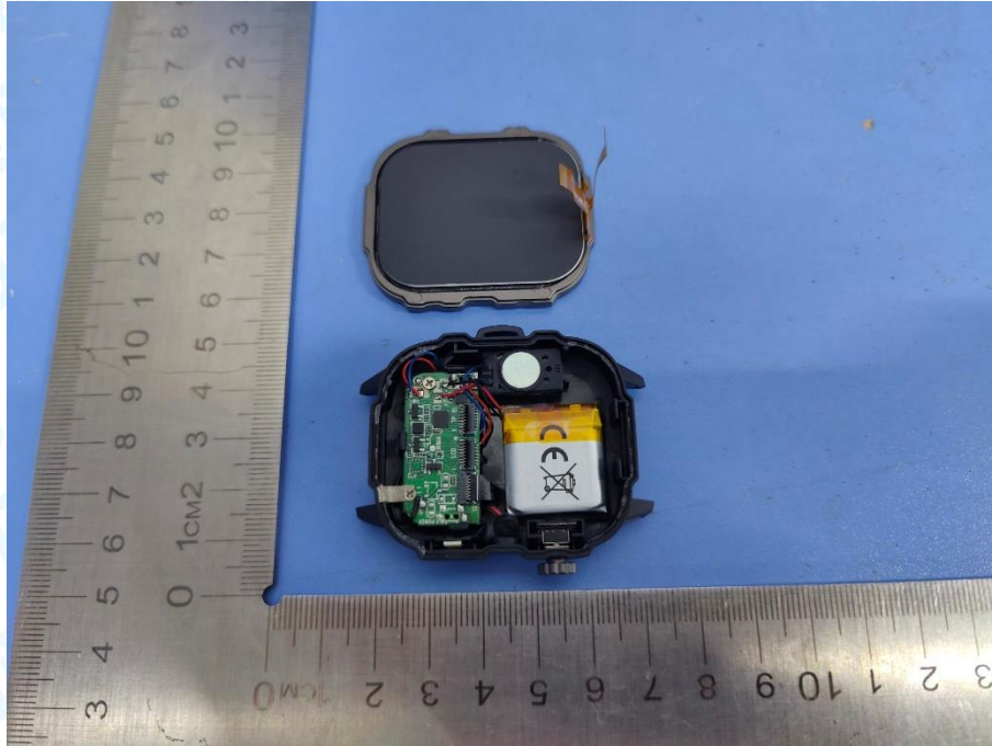
Photo 8 Appearance of PCB