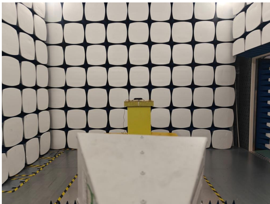
Radiated Spurious Emission: 1GHz-18GHz