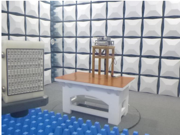
AC Conducted Emission