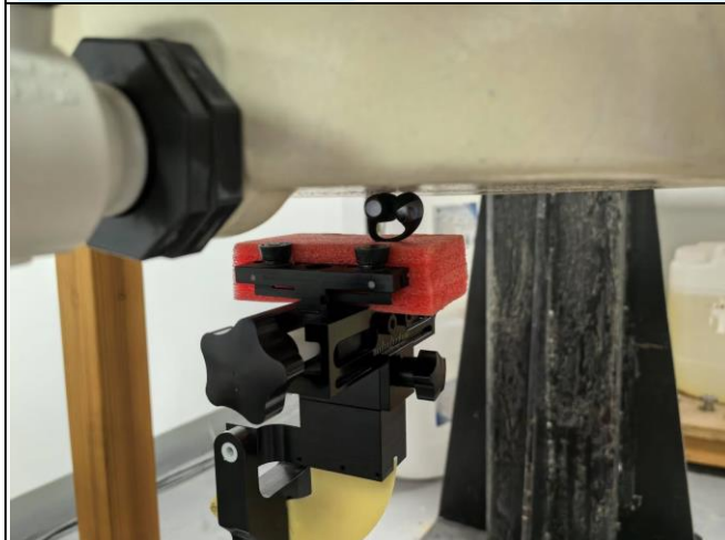
Bottom of Earphone with 0 cm Gap