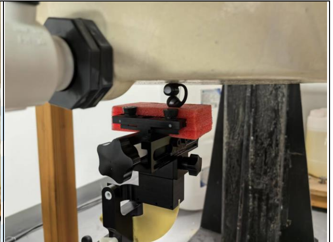
Rear Face of Earphone with 0 cm Gap