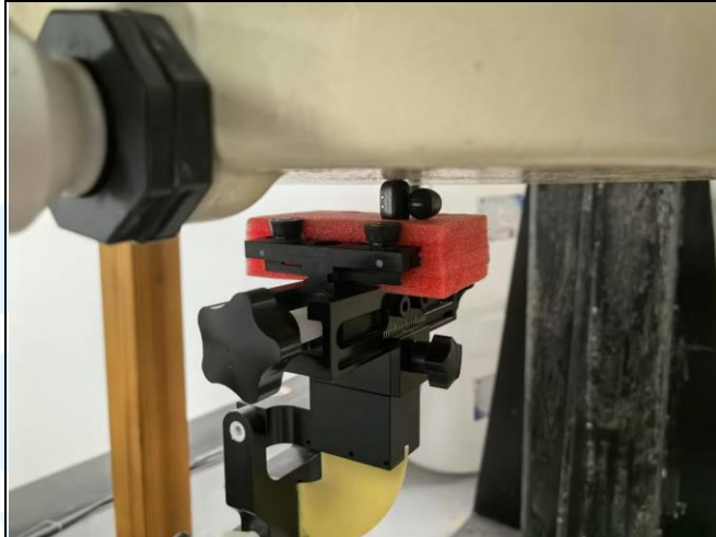
Left Side of Left Earphone with 0 cm Gap