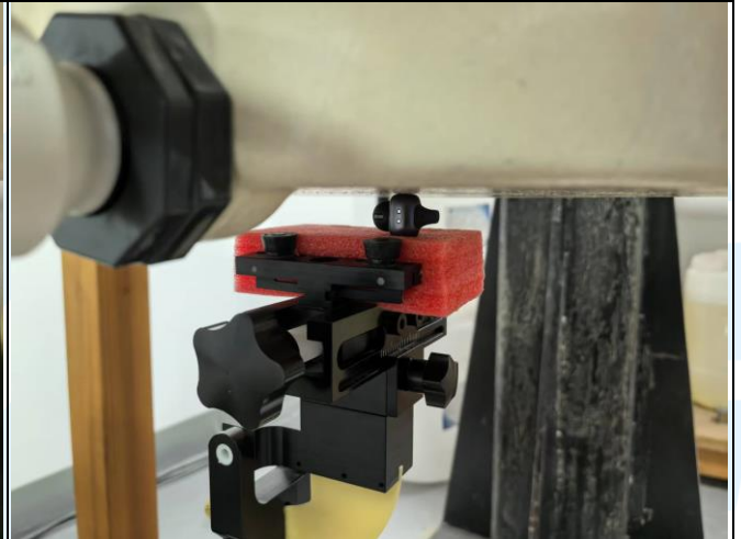
Right Side of Earphone with 0 cm Gap