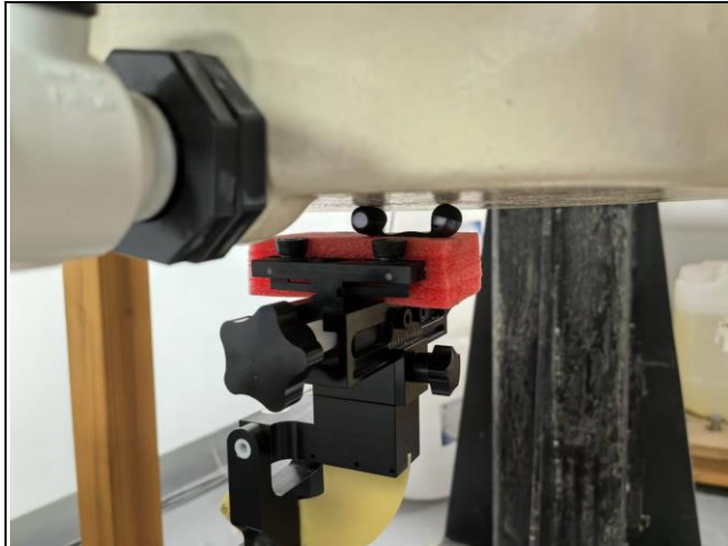
Inside of Earphone with 0 cm Gap