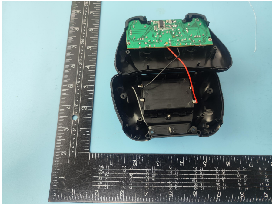
INTERNAL PHOTO OF SAMPLE