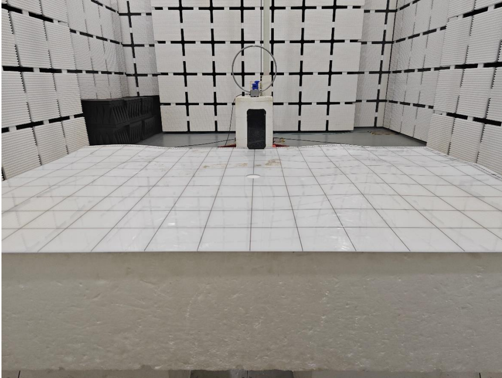
Set-up for Radiated Spurious Emission, Below 1GHz