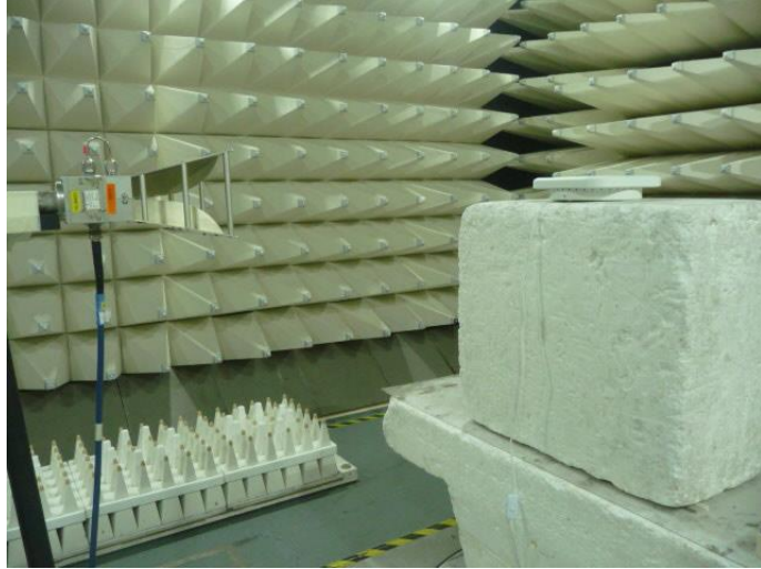
Photograph No.1 Carrier field strength and OBW measurement setup