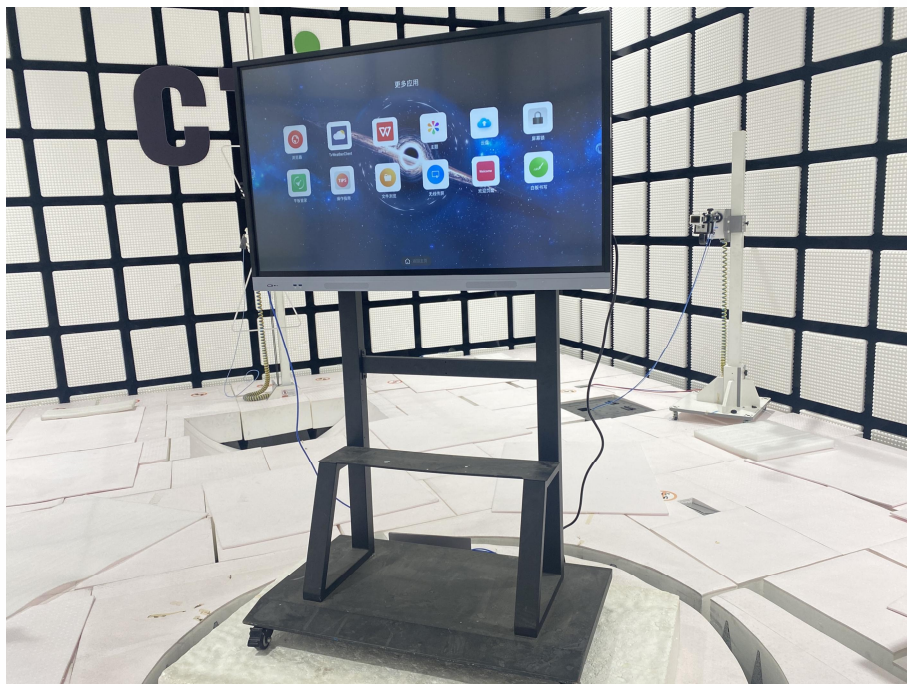
Radiated spurious emission Test Setup-3(Above 18GHz)