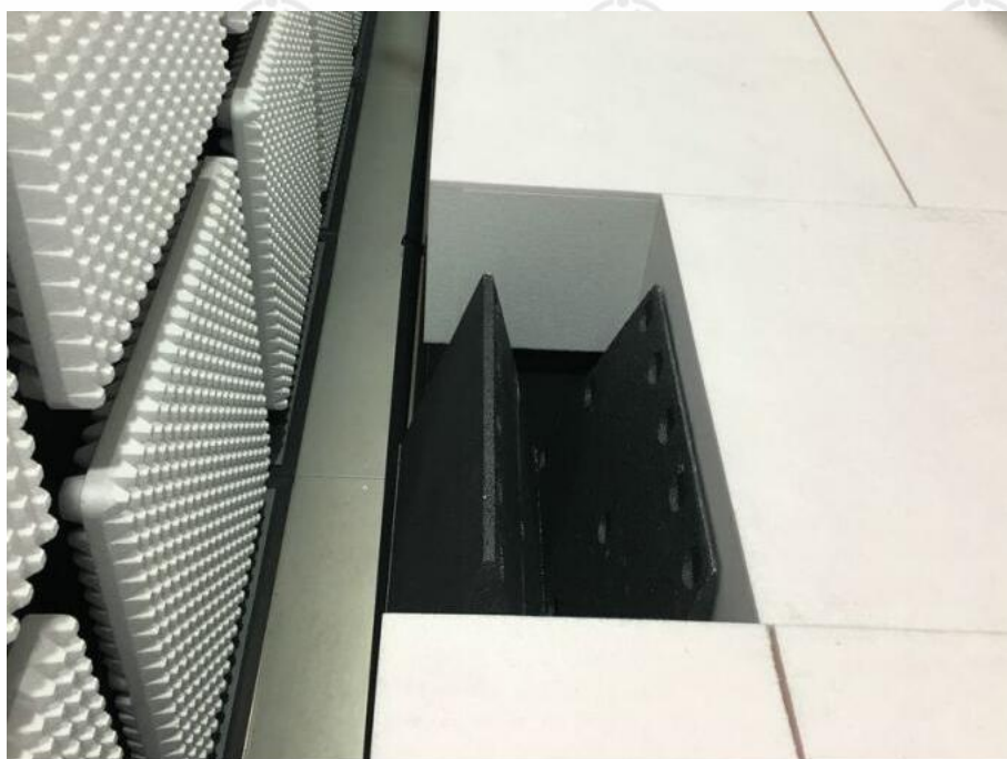
Radiated spurious emission Test Setup-4 There are absorbing materials under the ground.