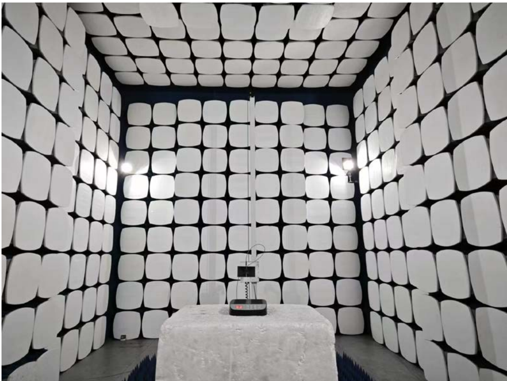
Radiated Setup photo (Above 1G)