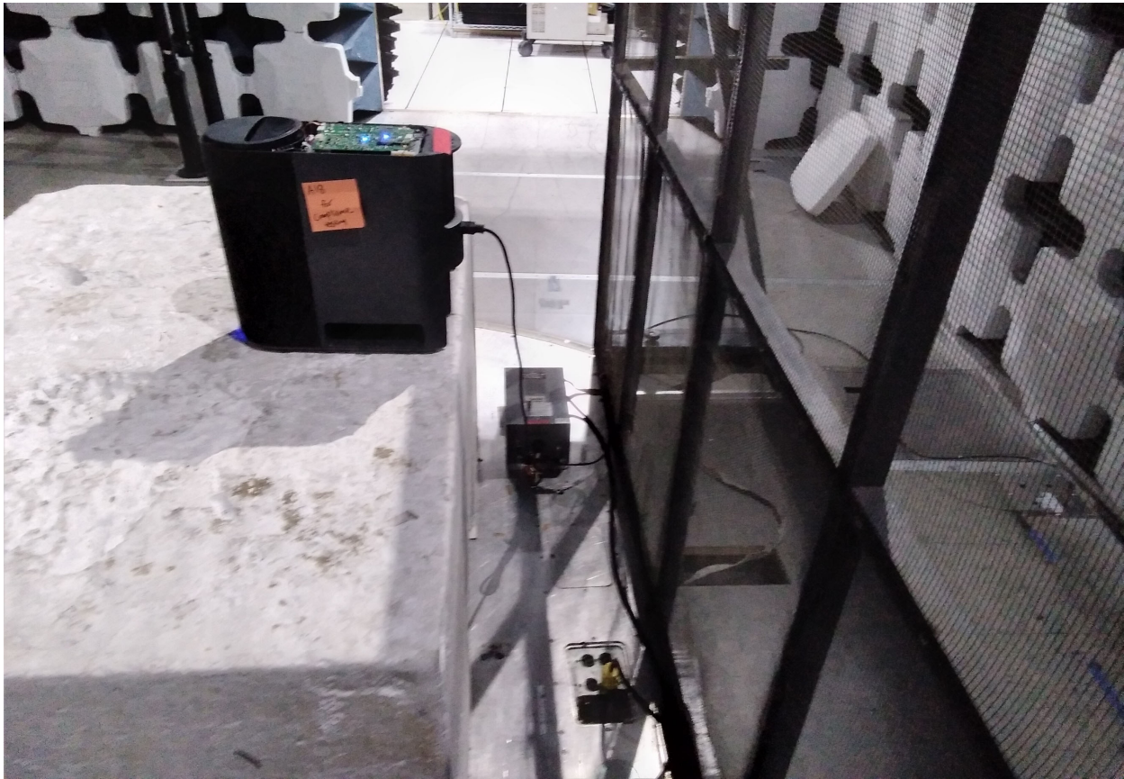
Test Configuration Photograph #2 (Conducted Emissions - Power Port)