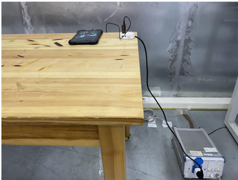
AC Conducted Emission of charge from power adapter mode