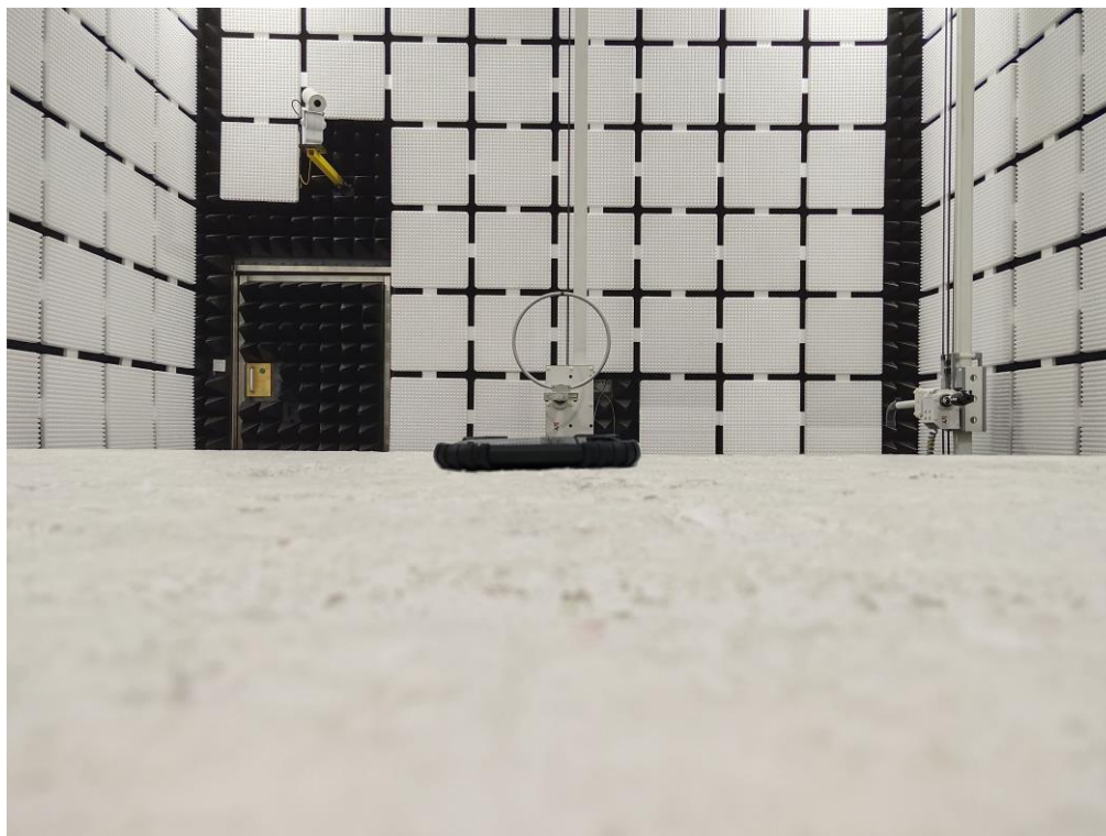
Fig. 1 (Below 30MHz)