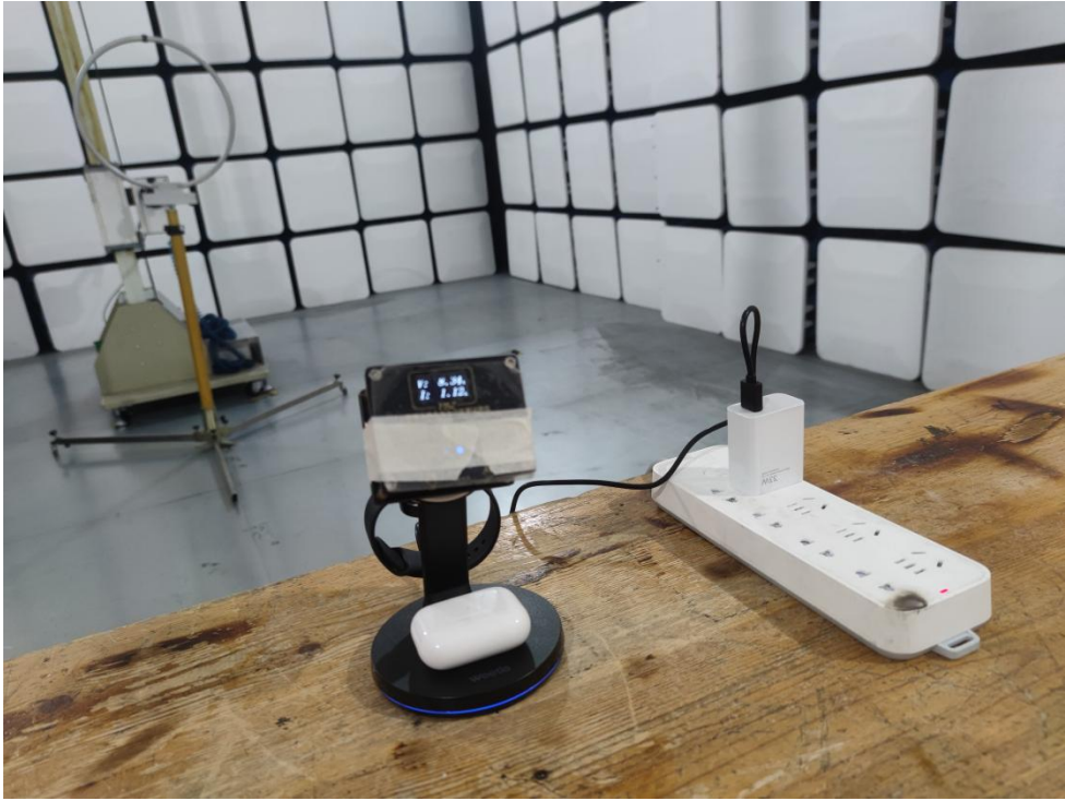
Photo of MPE Measurement