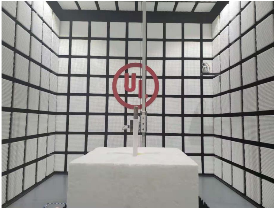
RADIATED RF MEASUREMENT SETUP (30MHz~1GHz)