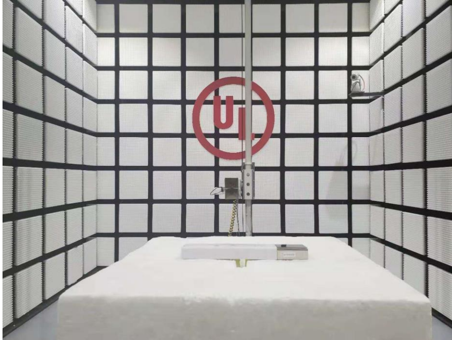
MEASUREMENT POSITION (Y axis)