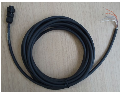
Figure 2: Main Cable (The power supply cable and RS-485 communication cable)

Figure 2 shows a photograph of the main cable (including the power cable and RS-485 communication cable) to be connected to the JRC-M's RADAR SENSOR.