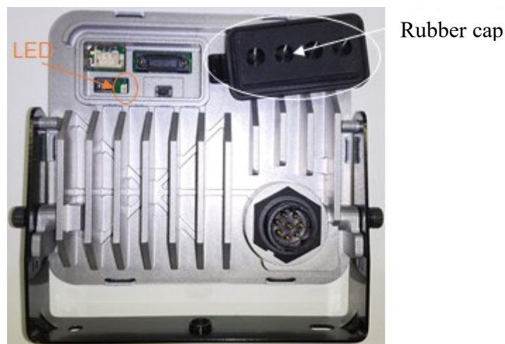
Figure 5: JRC-M's RADAR SENSOR with its rubber cap on the back opened

Figure 5 shows the JRC-M's RADAR SENSOR with its rubber cap on the back opened. In the normal state of the operation of JRC-M's RADAR SENSOR, the LED is blinking.