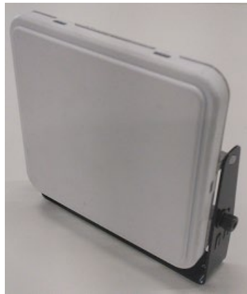
Figure 1: JRC-M's RADAR SENSOR with the bracket

Figure 1 shows a photograph of JRC-M's RADAR SENSOR with the bracket.