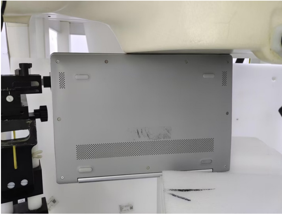
Body Right Setup Photo (0mm)