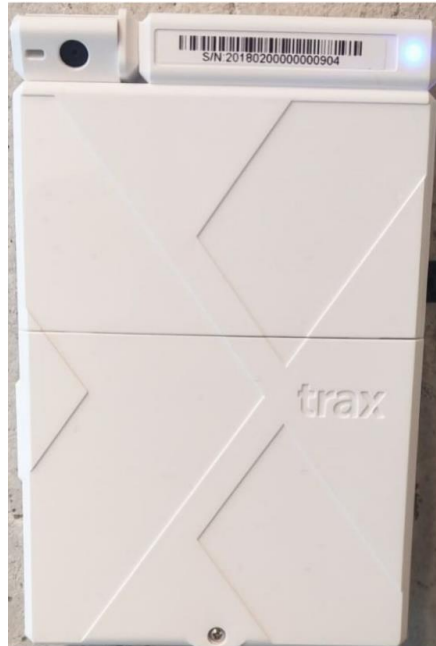
Battery panel screw