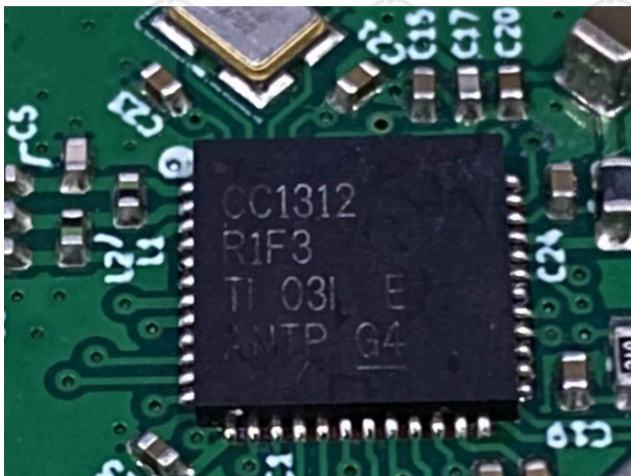
View of Product-14