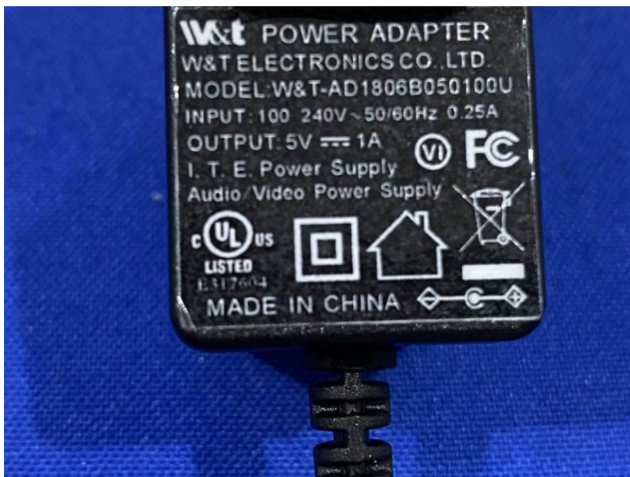
View of Product-15

The test report is effective only with both signature and specialized stamp. The result(s) shown in this report refer only to the sample(s) tested. Without written approval of CTI, this report can't be reproduced except in full.