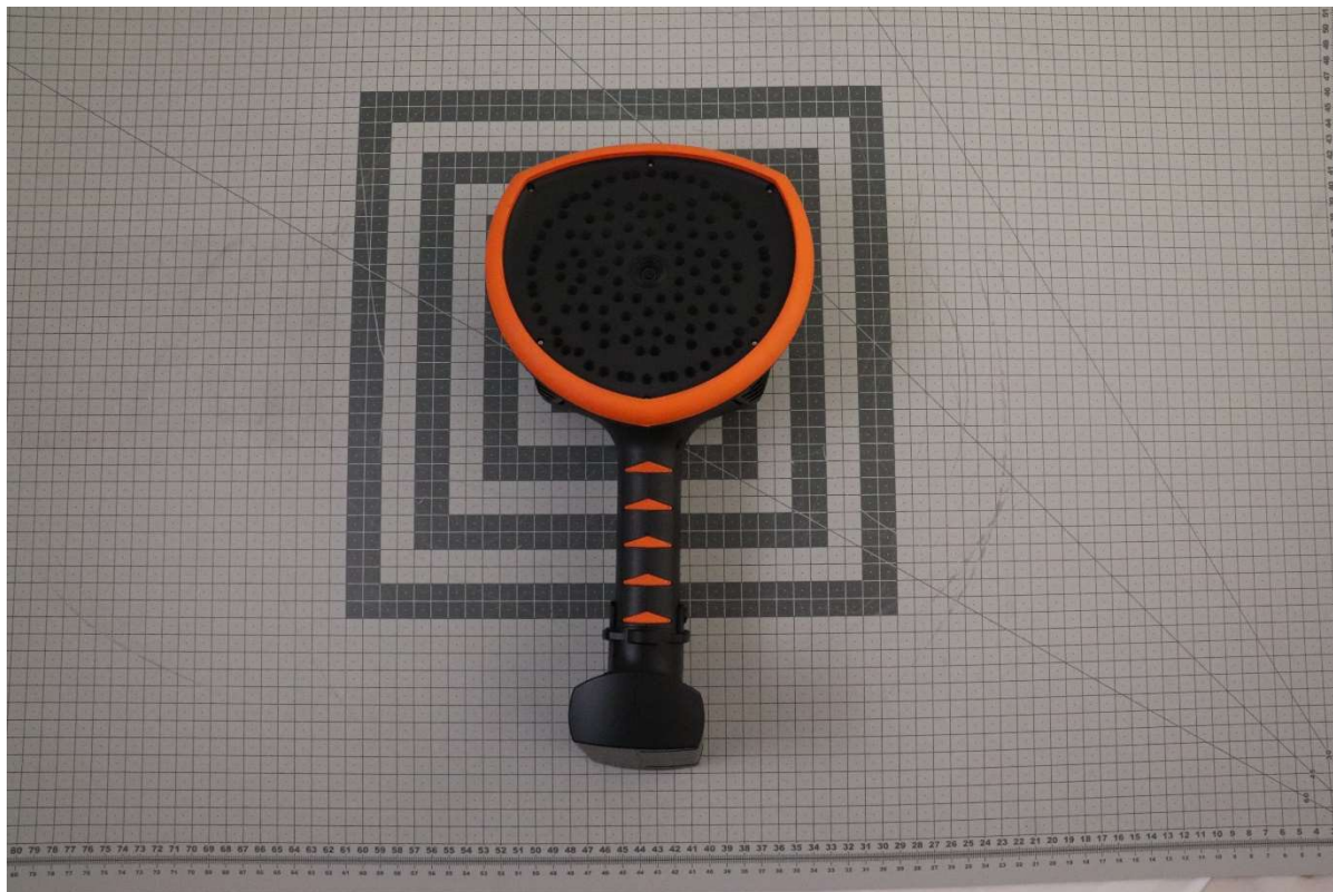
Photograph 1. The EUT