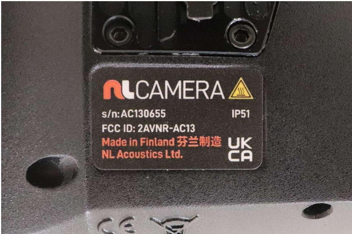
Photograph 3. The type label of the EUT