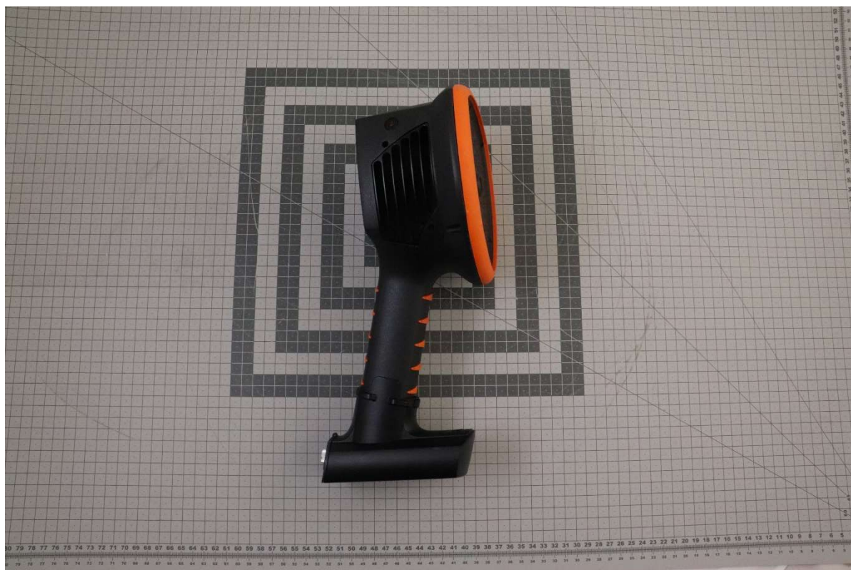
Photograph 2. The EUT