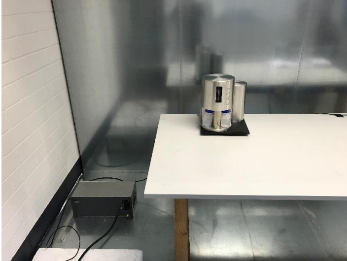
Photo to the test: Conducted limits – AC Port / USB Port / LAN Port