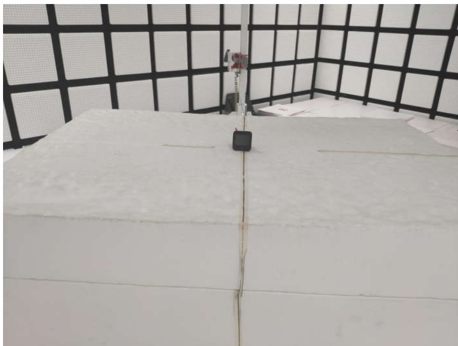
Radiated spurious emission Test Setup-3(Above 1GHz)