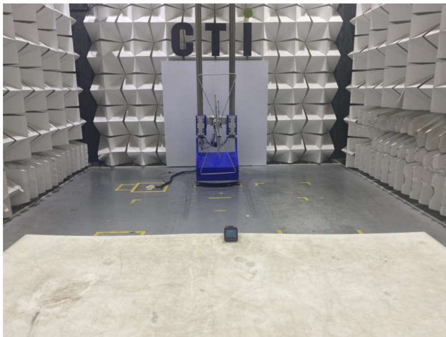
Radiated spurious emission Test Setup-2(Below 1GHz)