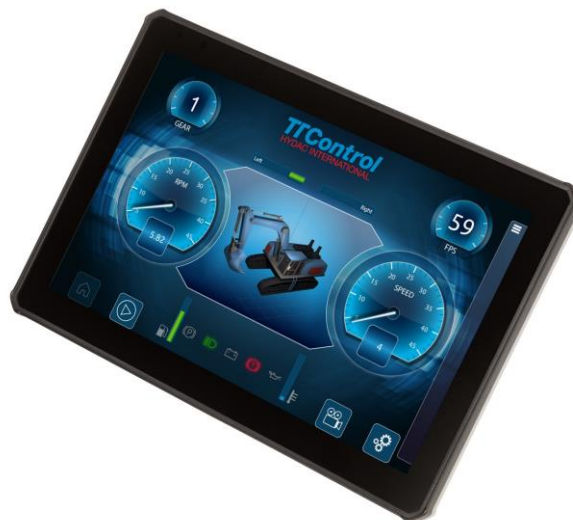
Figure 1: Product Vision 312

Device that the certification is applied for: