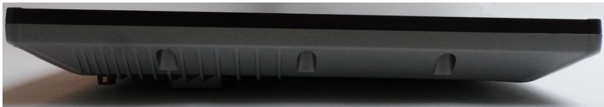
Figure 4: Bottom view