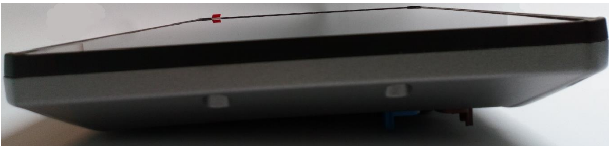
Figure 6: Left view