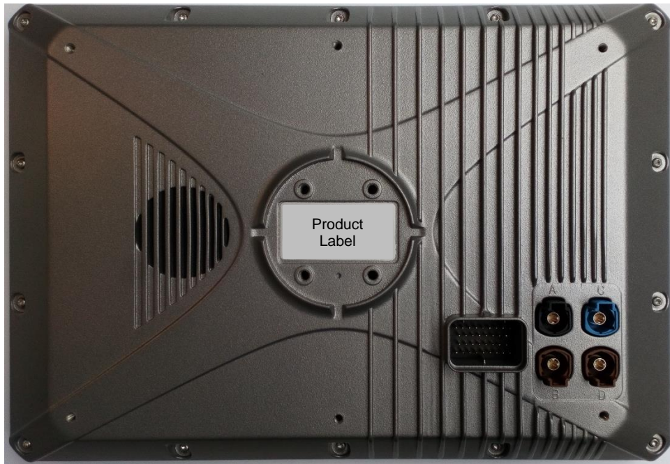
Figure 7: Rear view