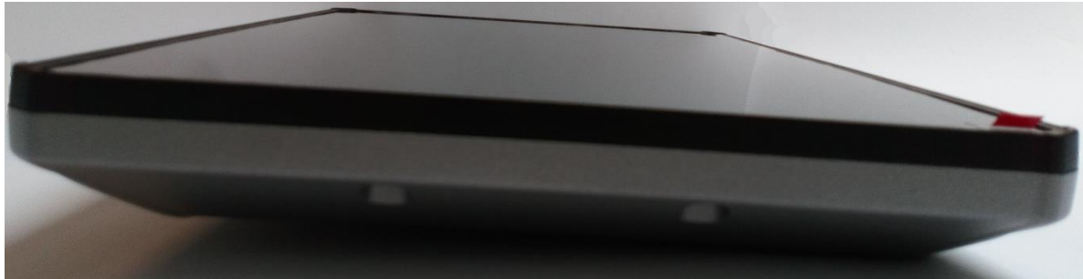
Figure 5: Right view