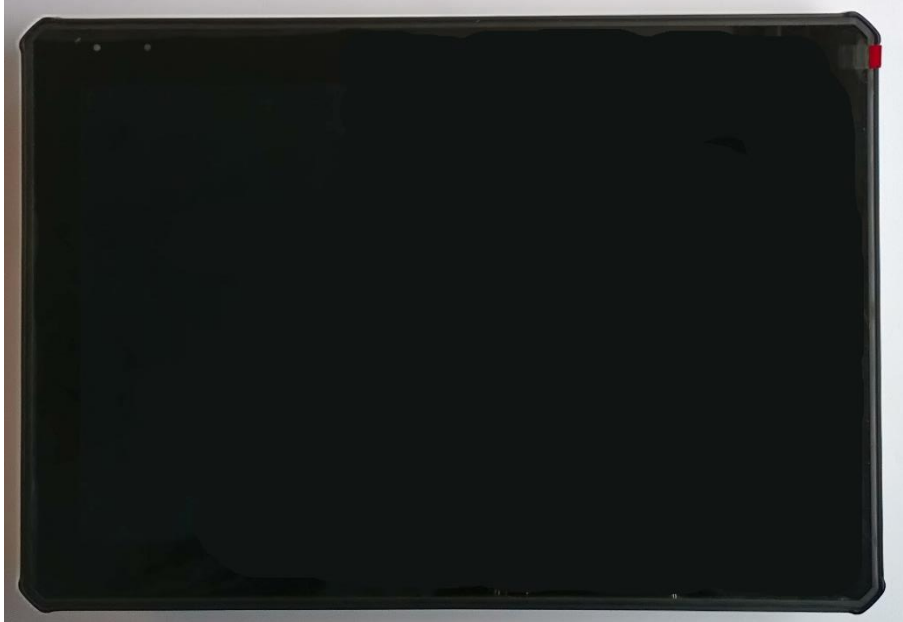
Figure 2: Front view