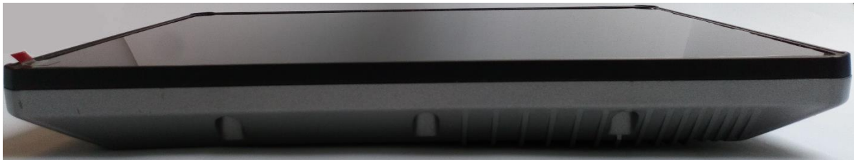
Figure 3: Top view