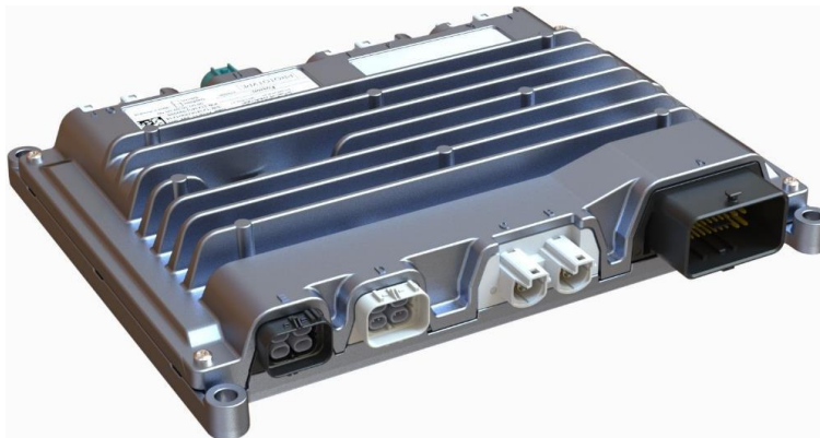
Figure 1: Product Fusion

Device that the certification is applied for: