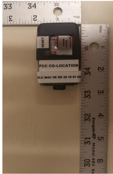
Figure B1. DUT top view