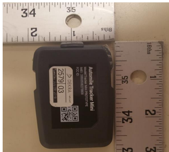
Figure B2. DUT rear view