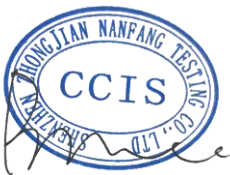
Bruce Zhang Laboratory Manager

This report details the results of the testing carried out on one sample. The results contained in this test report do not relate to other samples of the same product and does not permit the use of the CCIS product certification mark. The manufacturer should ensure that all products in series production are in conformity with the product sample detailed in this report.