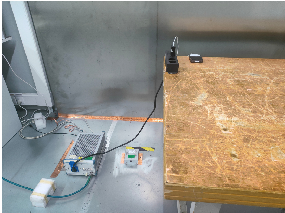
A photograph of a wooden workbench. On the left side of the bench, there is a black power strip with two circular outlets and several rectangular outlets. A black power cord is plugged into one of the rectangular outlets. To the right of the power strip, a black mobile phone is lying on the wood. The phone has a white label on its back with text that is partially legible, including "TCL" and "X600". A white charging cable is plugged into the bottom of the phone. The workbench is made of light-colored wood with a visible grain and some scratches. In the background, there is a grey metal structure and some other equipment, including a white power supply unit and some orange and white cables.