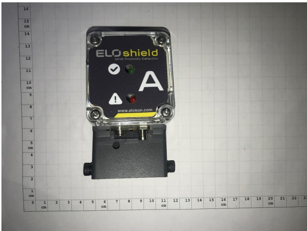
Photograph 6: AE 4, top view