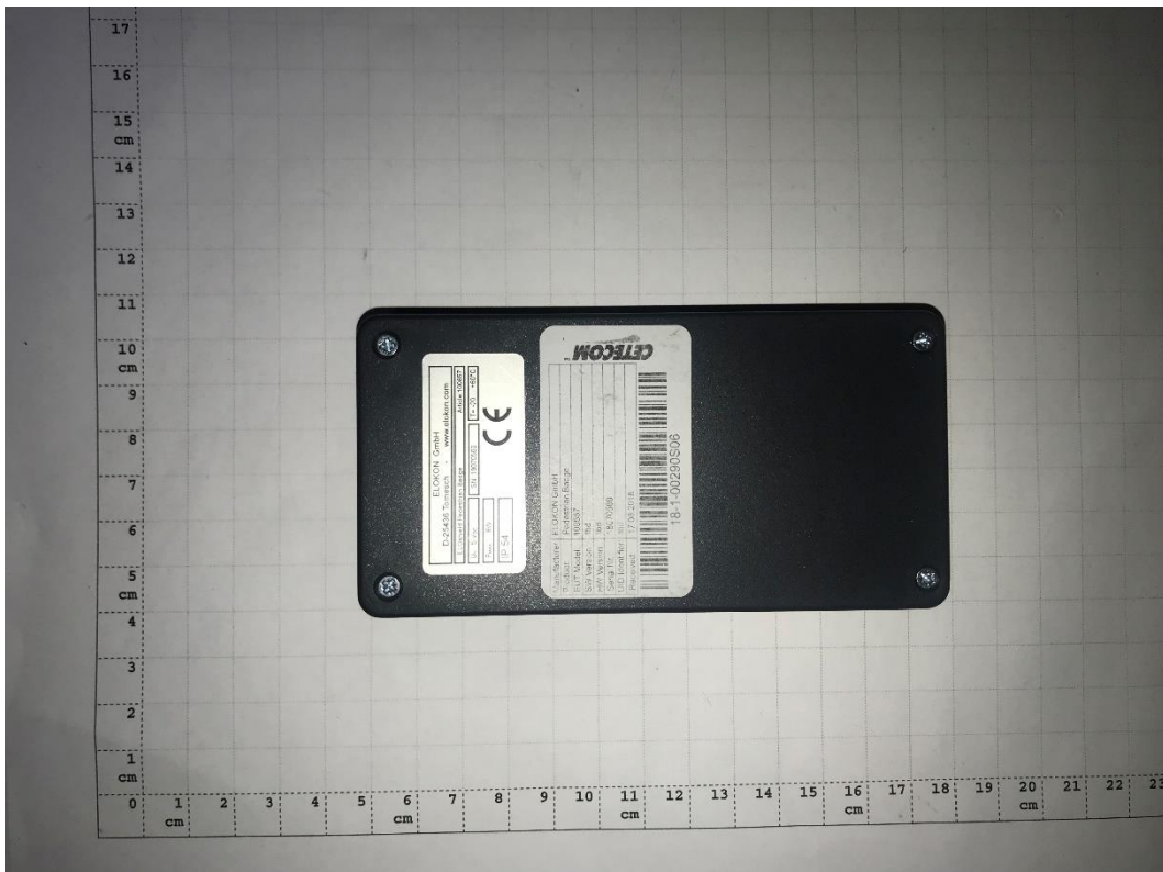
Photograph 2: EUT A, bottom view