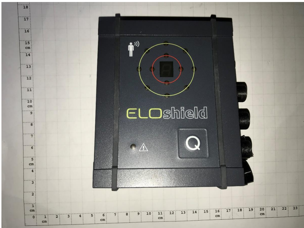
Photograph 4: AE 3, top view