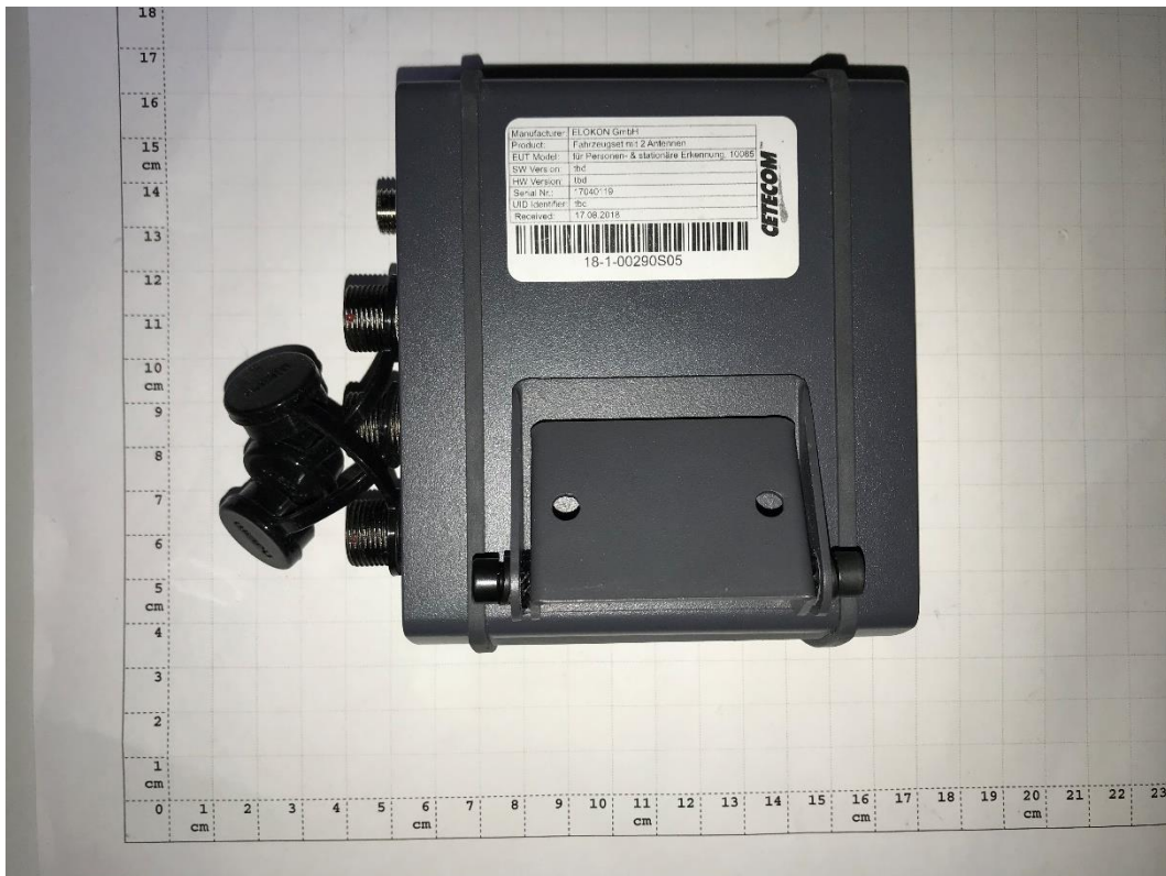
Photograph 5: AE 3, bottom view