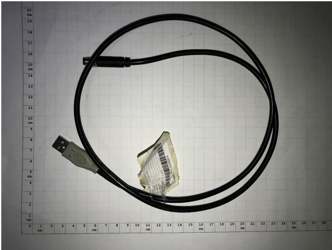
Photograph 9: AE 7