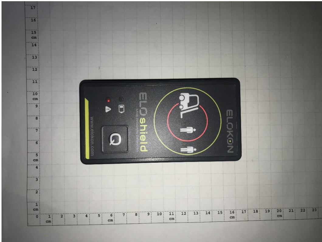
Photograph 1: EUT A, front view