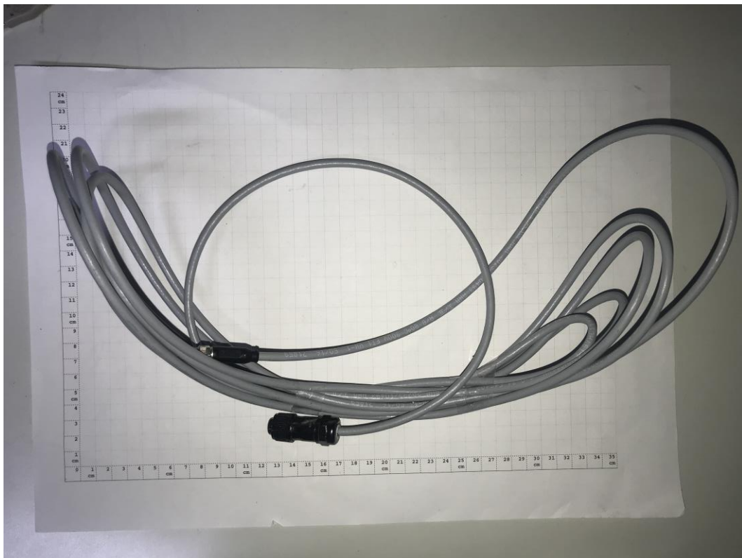
Photograph 8: AE 6